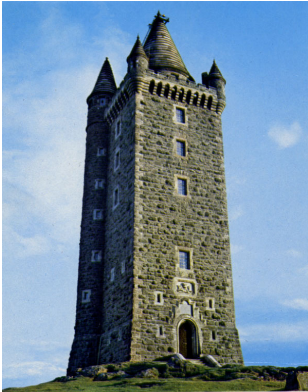
The Scrabo Tower, Newtownards, Northern Ireland "SCRABO TOWER stands on a granite outcrop, forming a landmark in the surrounding country. It was erected in 1851 in memory of the 3rd Marquis of Londonderry."

such as the family of Grey Lag geese near a shelter which protected us from strong cold winds and the periodic driving rain.