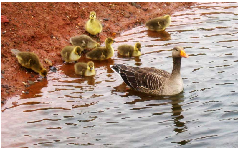
Family of Grey Lag Geese at Castle Espie Wetlands Centre.

It was still light when we passed through Belfast to return the car to the rental agency at the International Airport 15 km outside the city. There was a very good bus service that took us back to the bus terminal